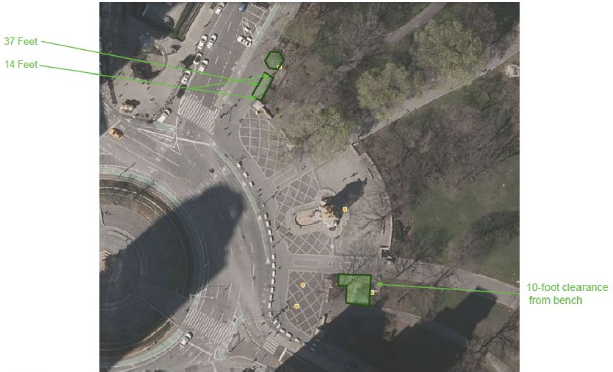
Central Park Bike Rental Locations – Columbus Circle