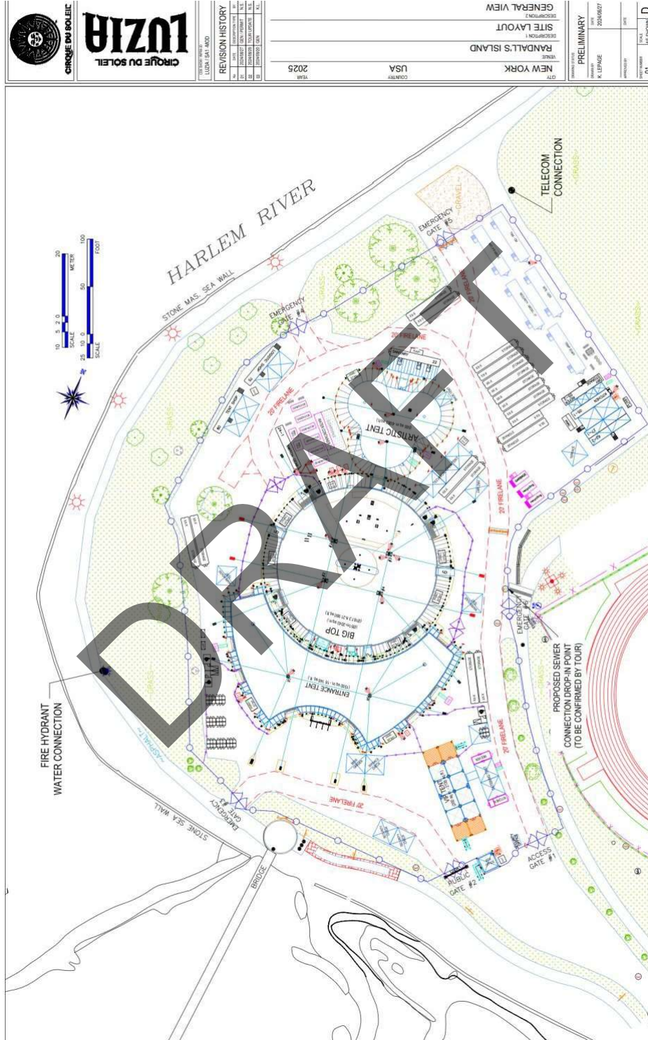
EXHIBIT A LICENSED PREMISES