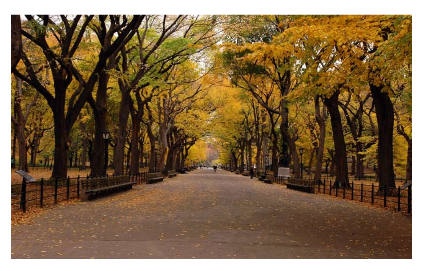
2,000,000 TREES IN LANDSCAPED PARK AREAS (ESTIMATED)