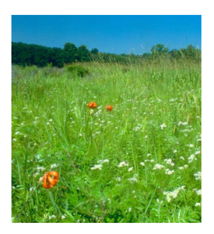
1,444 ACRES OF MEADOW/GRASSLAND