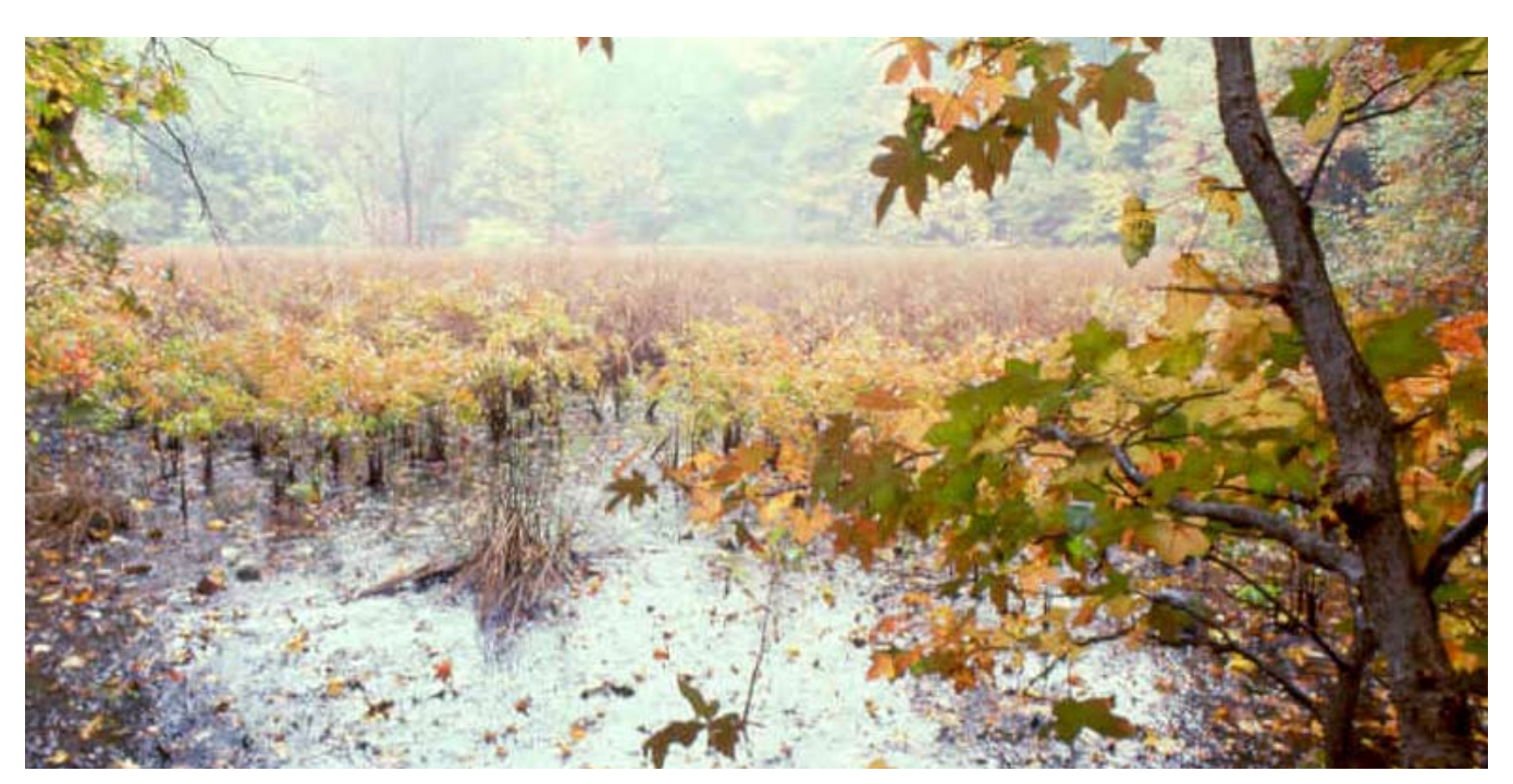
1,651 ACRES OF FRESHWATER WETLAND