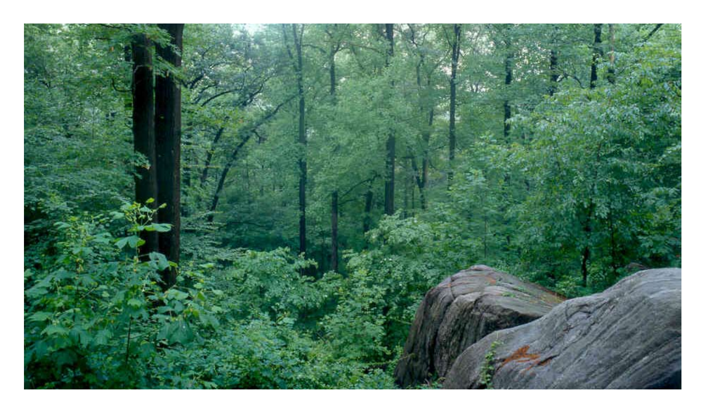
5,136 ACRES OF FOREST