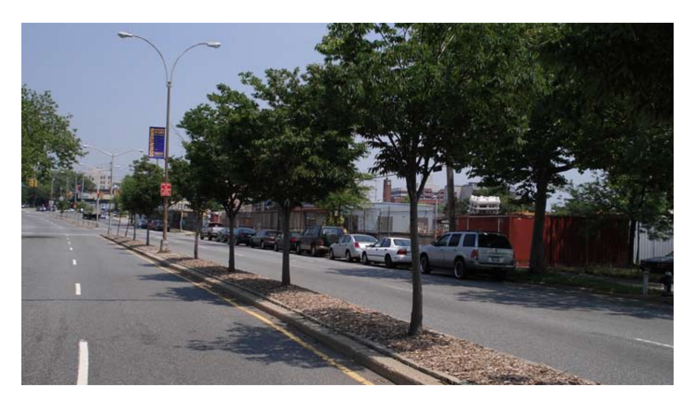
593,132 STREET TREES