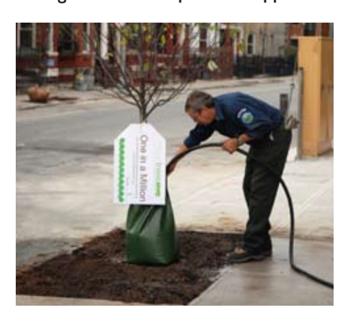
A city park worker waters a newly planted tree.

The emergence of MillionTreesNYC as a research opportunity coincides with the completion of the Urban Field Station, a new laboratory and short-term residential facility shared by Parks and the Forest Service and located in Bayside, Queens. The Urban Field Station is the outcome of a Memorandum of Understanding signed in 2006 between NYC Parks and the USFS Northern Research Station (NRS) to establish a long-term research partnership to deepen our understanding of urban ecology and strengthen urban natural resource management. The Urban Field Station is one of the institutions through which the work of the MillionTreesNYC Research & Evaluation Committee and the research efforts initiated through this workshop will be supported and continued.